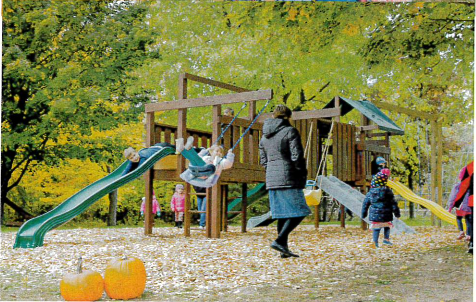
Thank you to all who helped to fund and to build the new Playground.